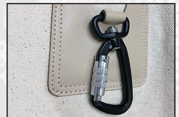
360° Locking Carabiner